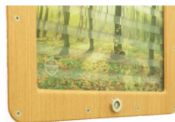
Picture Panel & Wrapped Fascia