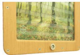
Picture Panel & Wrapped Fascia