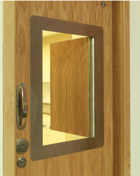
Hatch shown from the corridor side