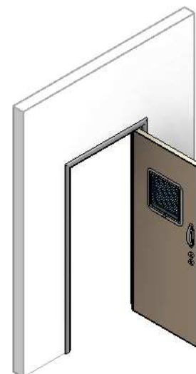
Fig.2 - 3D view of the Kingsway Swing Doorset in the open position. The family provides the ability to view the door in closed or open positions in 3D views without the need for creating additional family types.

Family Name: Kingsway Swing Doorset - Single Leaf