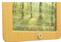
Picture Panel & Wrapped Fascia