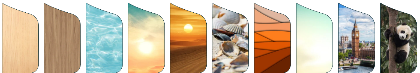
Wood 1 1813102735