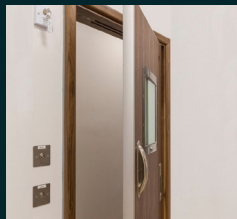
Optional recessed KG75 electro handle for patient to release door from the inside