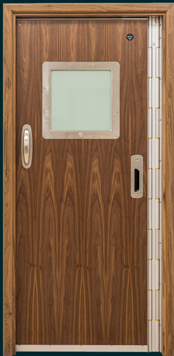
Full height sensor to door edge

The SENTRY Full Door Edge Alarm System is designed to maximise patient safety and assist clinical staff in preventing loss of life in mental healthcare environments. The SENTRY door features pressure sensors to all three exposed edges of the door which will trigger the staff alarm in the event of a ligature being trapped against them. The SENTRY system works whatever position the door is in - open or closed - and is hardwired by design to provide the robustness and reliability demanded for an assistive clinical product within a life-critical system.