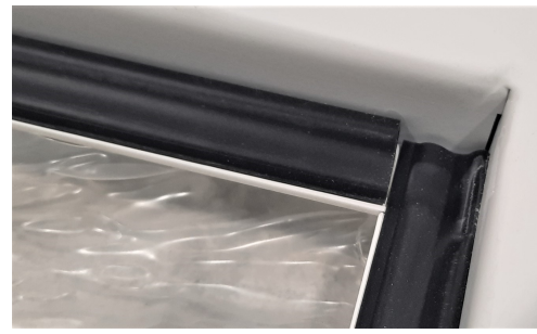
Infection Control Gasketing