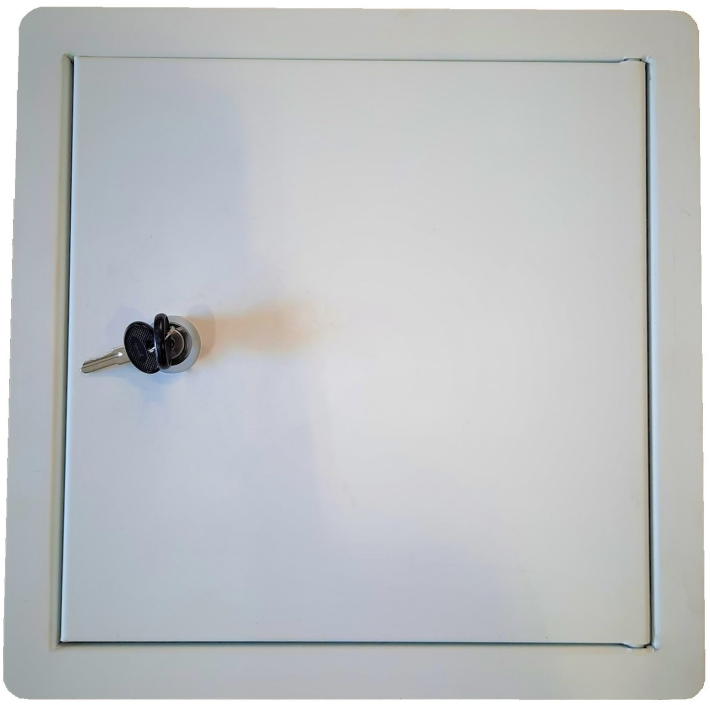
KG360 Exterior (8"x8" Sample shown does not require 3-Point Locking)