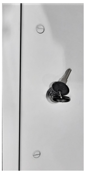
3-Point Locking System