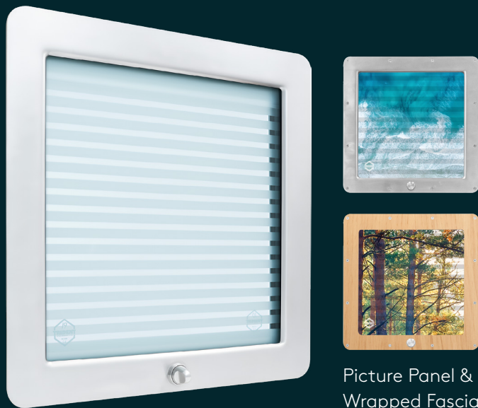
Picture Panel & Wrapped Fascia

Duralux is the original high-strength vision panel designed specifically for behavioral health environments. Ligature-resistant by design, it features two panels of impact-resistant glazing securely sealed between two 14GA Stainless Steel Fascias, providing a highly durable and robust observation solution with frosted privacy stripes. Unique to Kingsway Group, the operating mechanism is housed within the steel fascia to ensure optimum strength.