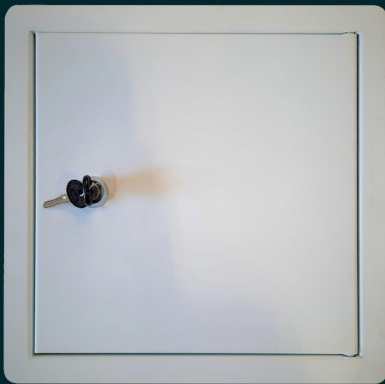
KG360 Exterior (8"x8") Sample shown does not require 3-Point Locking

The KG360 series of secure wall mounted ligature-resistant access panels allow for ease of access and operation while protecting against abuse and patient self-harm. Available in a range of sizes to meet your facility's requirements. Fitted with a Cam-Lock lockset and operated by a standard dispenser.