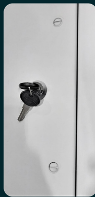
3-Point Locking System